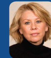
Monica Mæland Chief Commissioner City of Bergen

Finally, I trust that you'll have some very exciting and interesting days in Bergen and I wish you all the very best of luck.